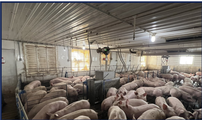
Tunnel Fan End