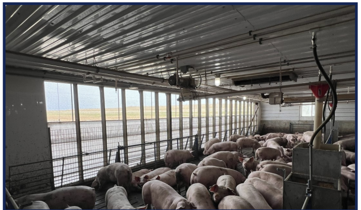
Tunnel Curtain End