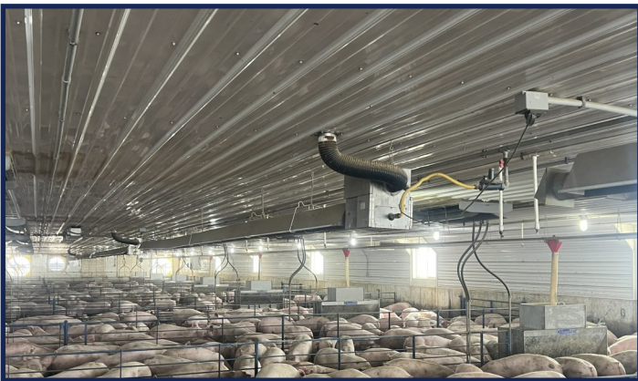
Ceiling Tube Heater