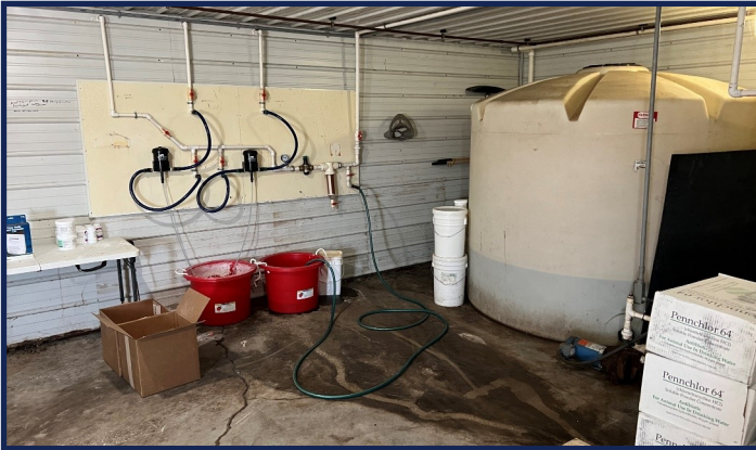
Medicators/ Water Storage