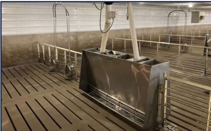
SS Wean Finish Feeders