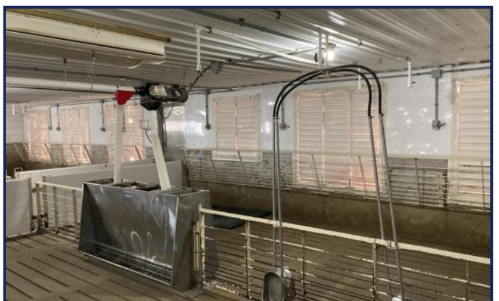
Fan End Wall