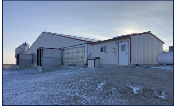
Site Office and Entrance