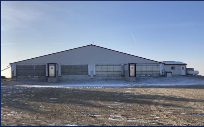
2,450 Wean Finish