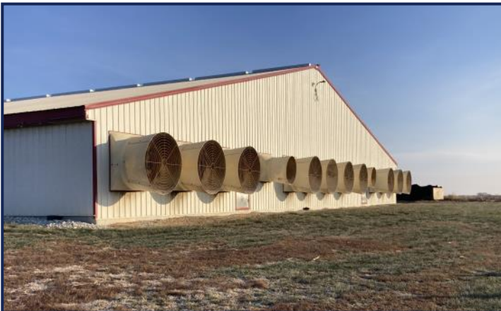
Exterior Fan End Wall