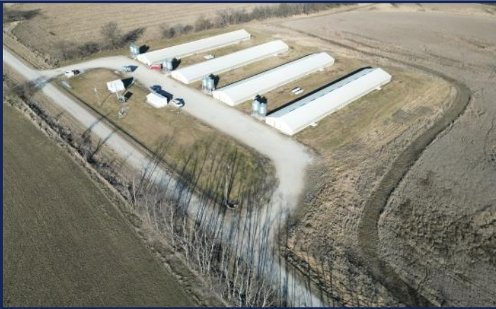
Southeast Aerial View