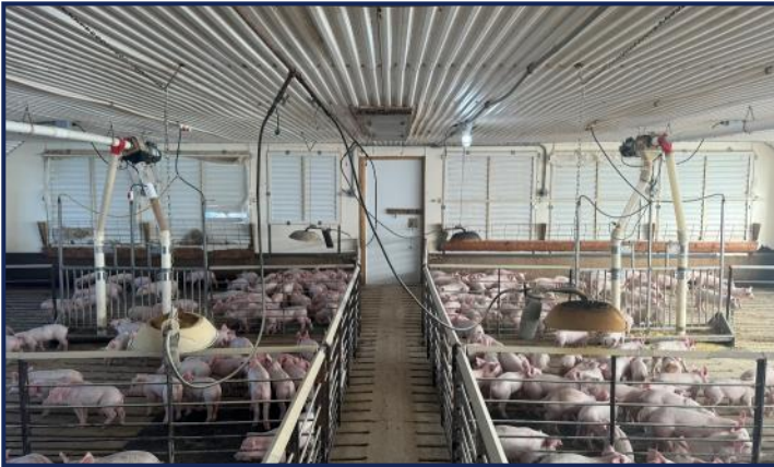
Tunnel Fan Wall