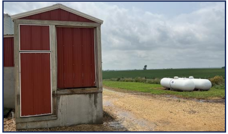
Ground and Dock Height Loadout