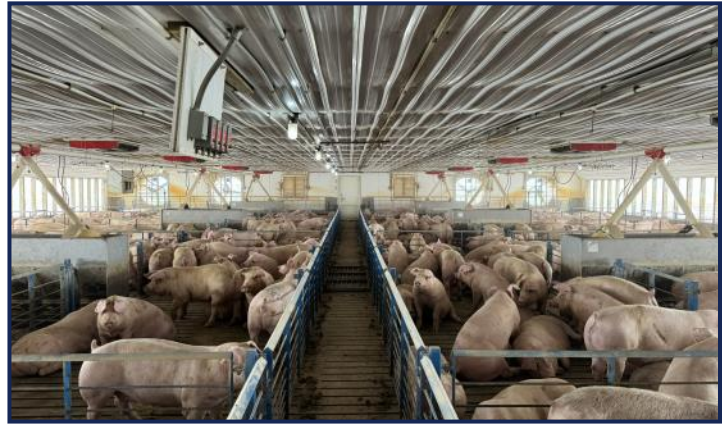
Tunnel Fan End