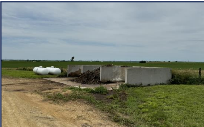
3 Bay Compost