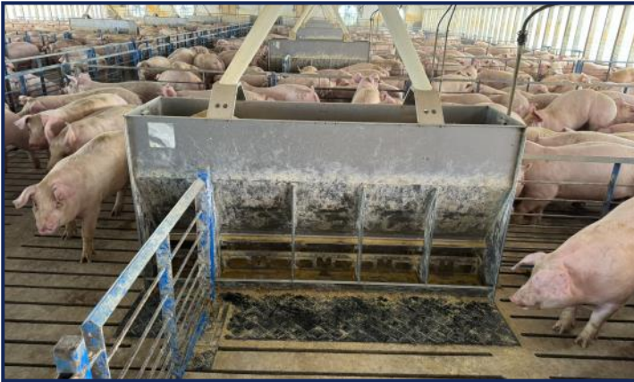
Wet Dry Feeder