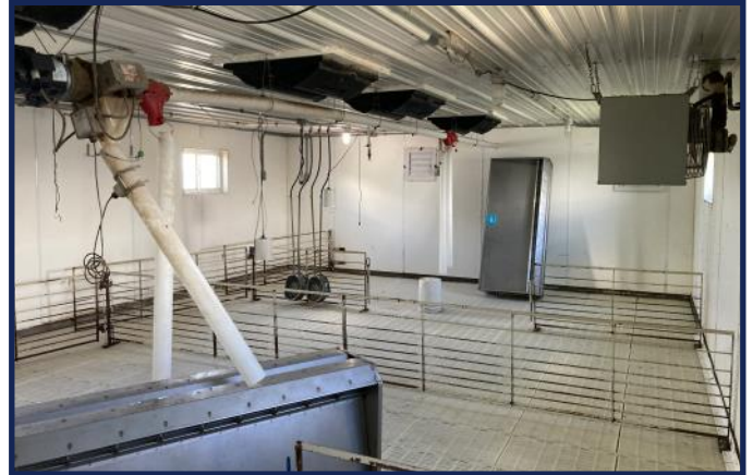
2nd Room View