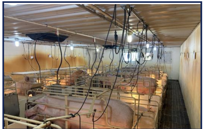
2nd Room View