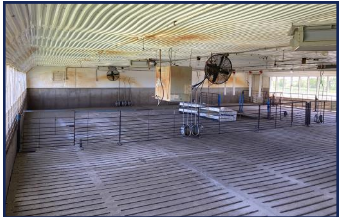
Interior Gilt Developer View