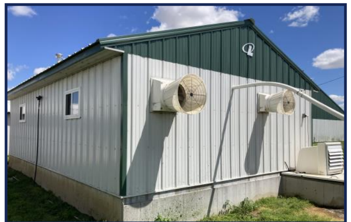
Incoming Nursery Gilt Building