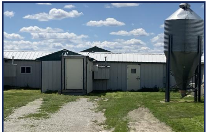
Attached Site Load Out