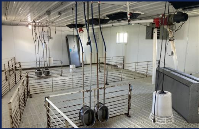
Nursery Interior View