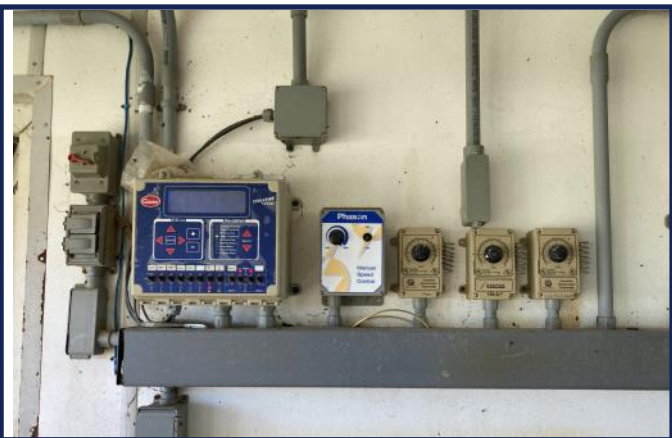
Gilt Developer Controller