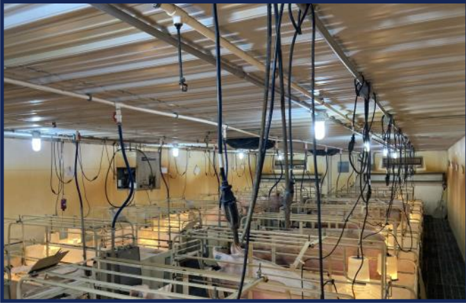
Farrow Room Interior