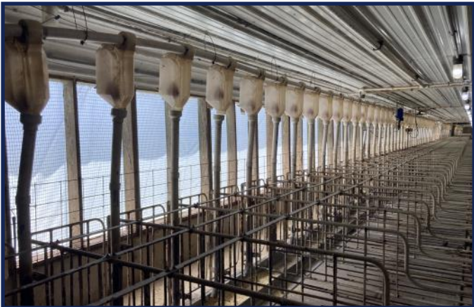
Gestation Interior View