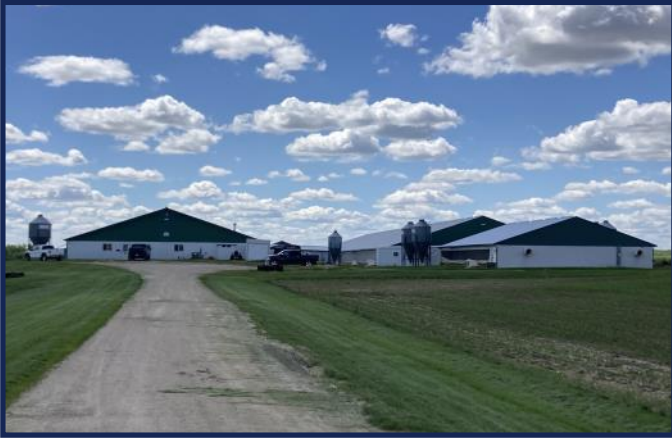
South Cedar Site