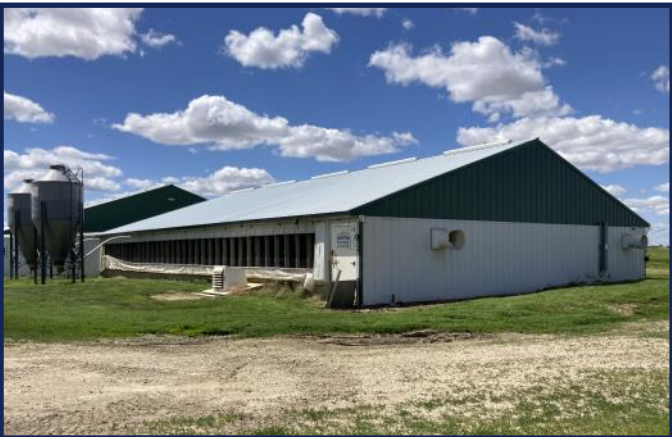
Gilt Grower & Developer Building