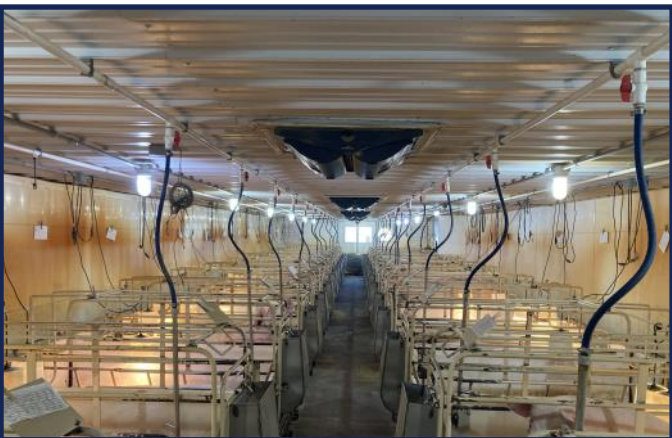
Typical Farrow Room View