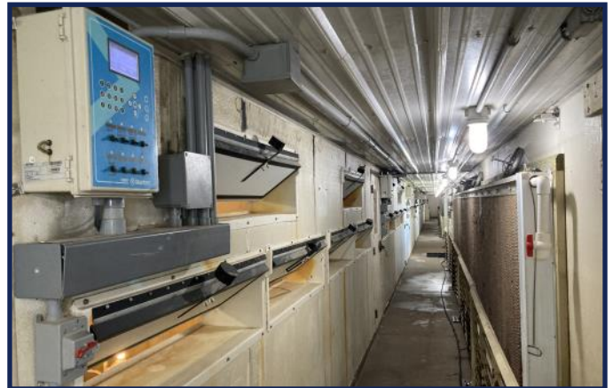
Hallway to 8 Farrow Rooms