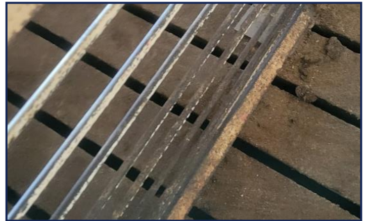
South Barn gating