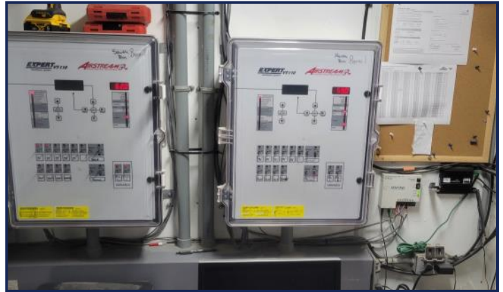
AP Expert Controllers