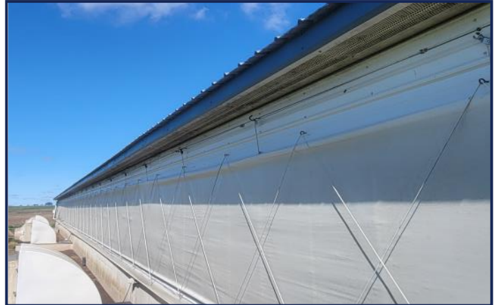
Curtains and Eaves