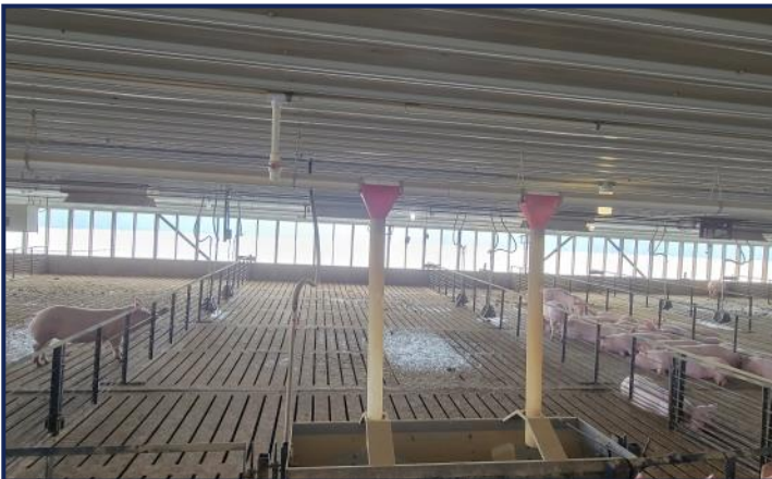
North Barn Large Pens– 1 Solid Slat