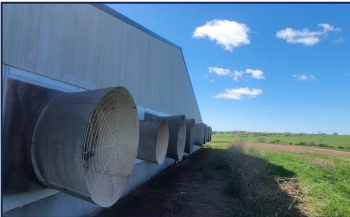
Tunnel Fans Typical