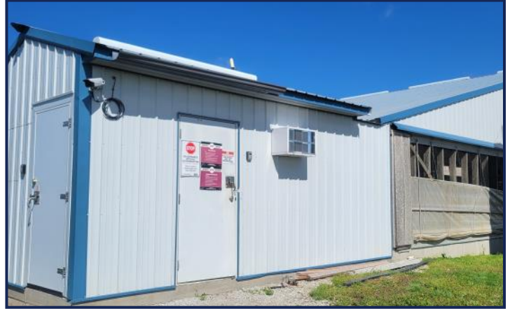
Biosecure Office– North Barn