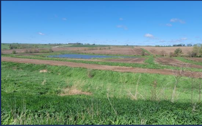
Pond Water Source to West