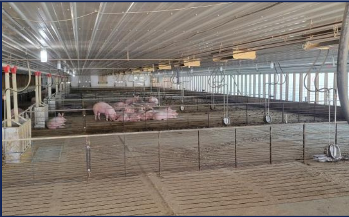
North Barn Interior