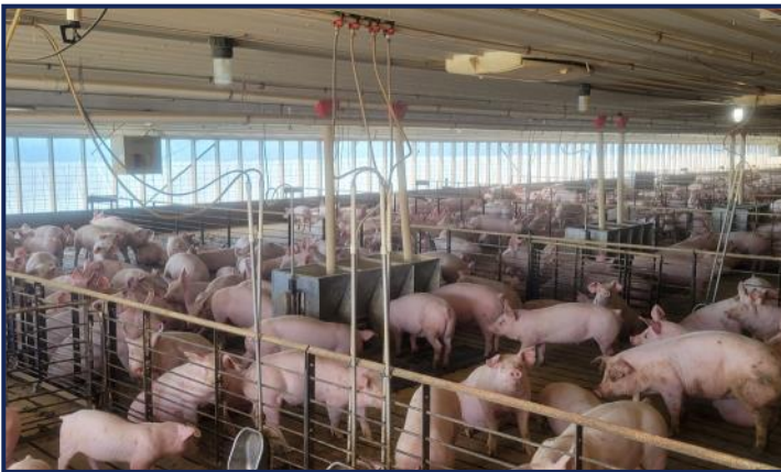
South Barn Pens