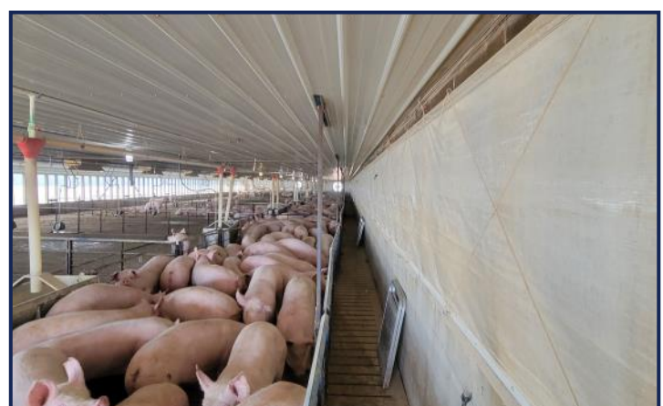
North Barn Sort Alley