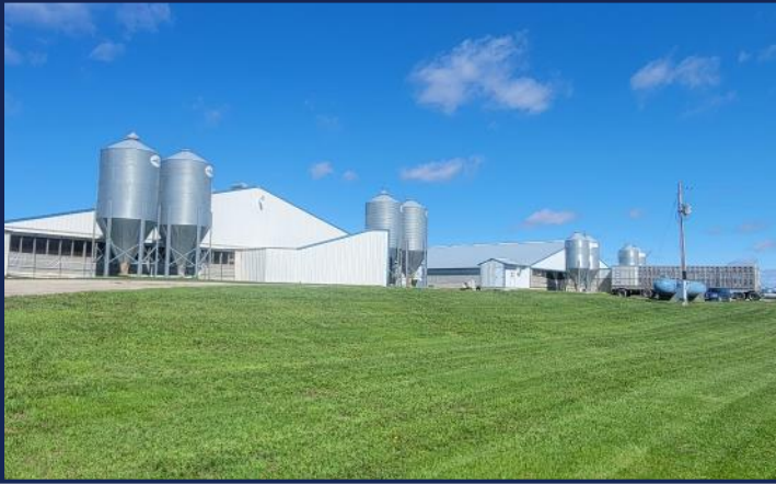
Site from Road