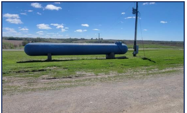
Large Capacity LP Tank