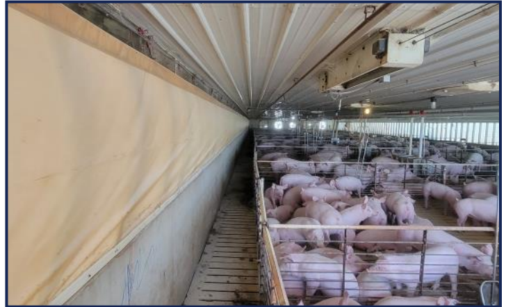
South Barn Interior