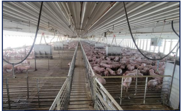
Interior In Very Good Condition