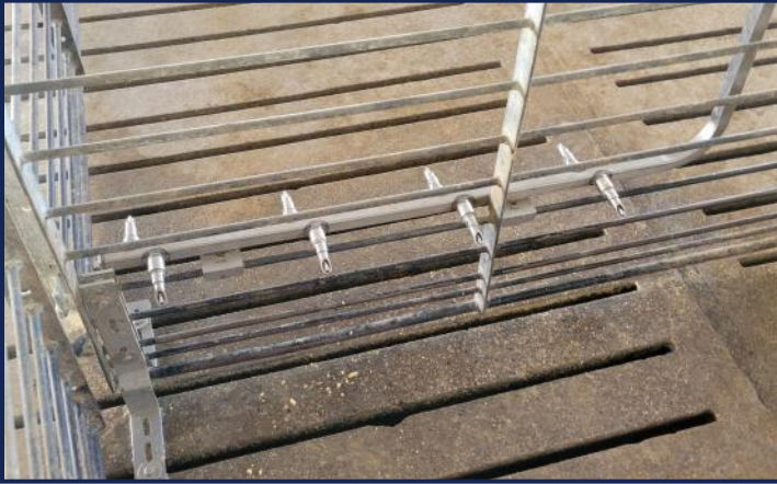
Galvanized Gating with SS Feet, Nipple Bars