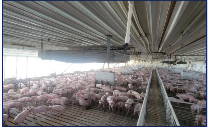
Wean Mats and Racks