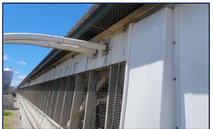
Curtains and Eaves