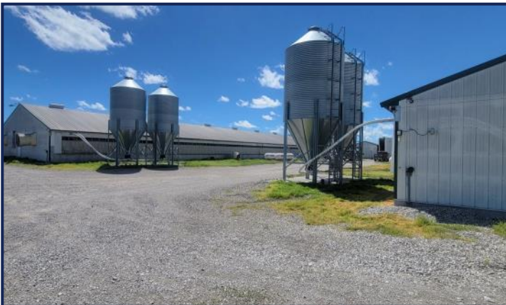
Drive and Bins