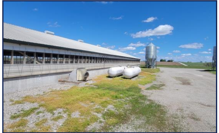
Exterior in Very Good Condition