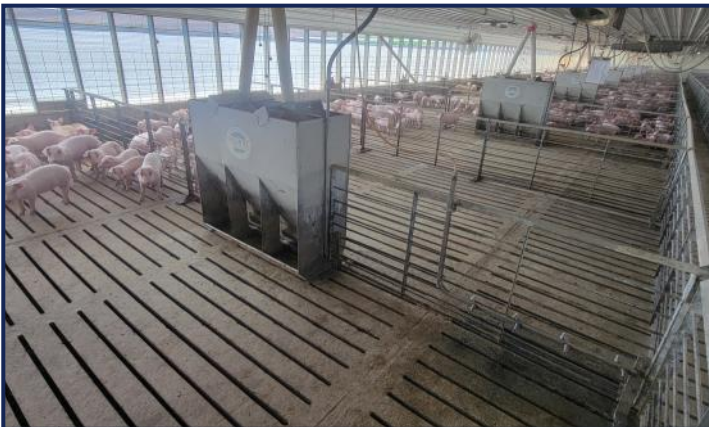
Pen Configuration, Feeders and Nipple Bar