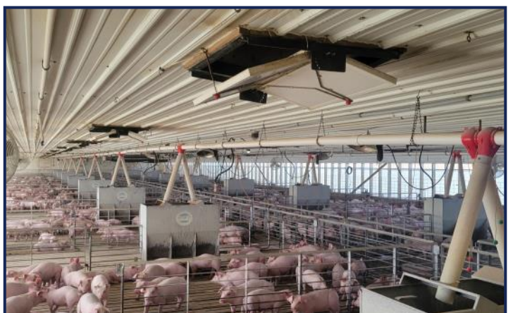
Actuated Inlets- Aluminum Ceiling