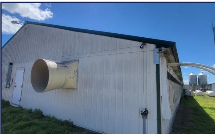
Gable End Steel and Fans