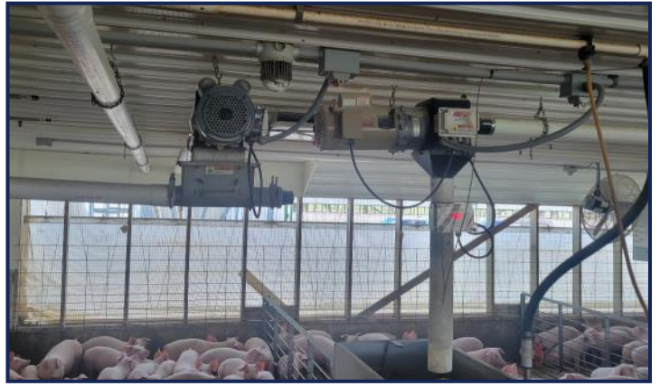
Feed Auger System