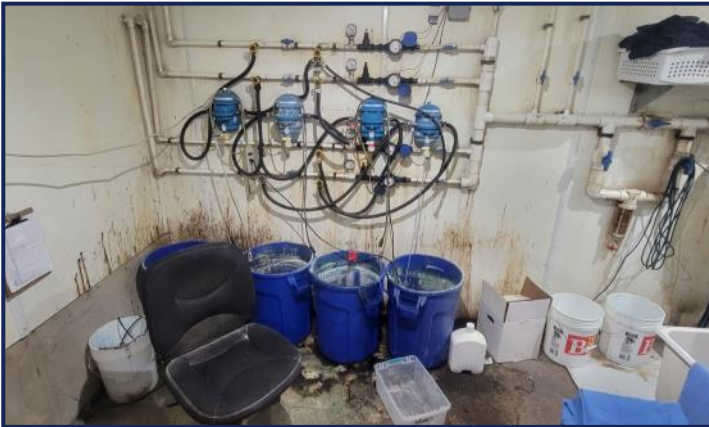
Medicator Setup in Office