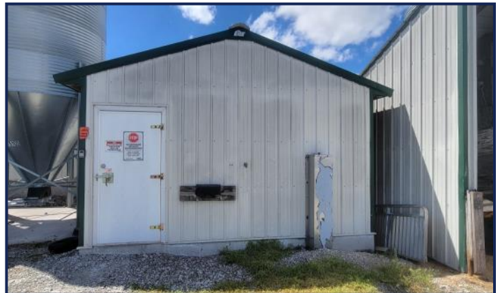
Office and Load Out