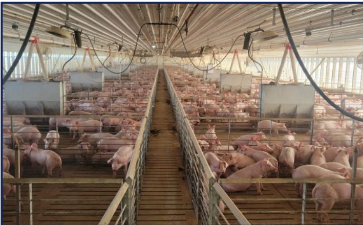
Brooder Heaters and Power Washing Line