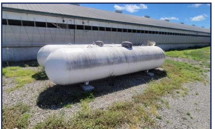
LP Tanks, Two Per Barn