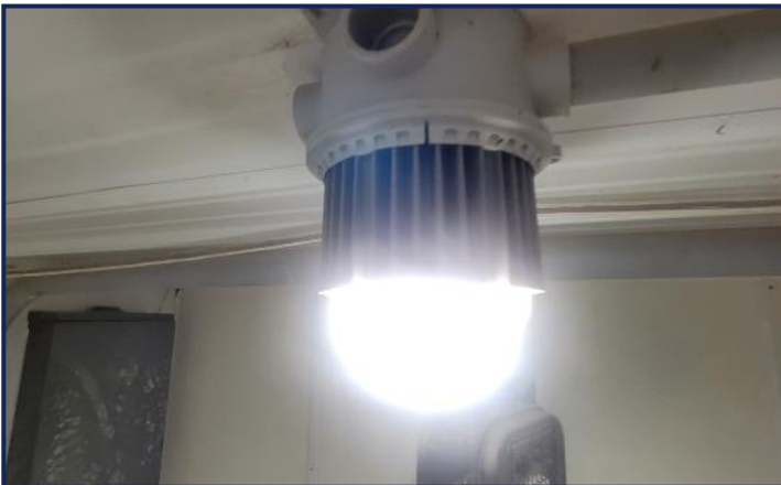
Led Lighting Throughout