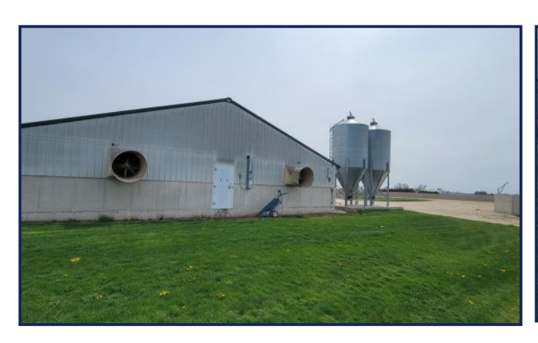
West Gable End