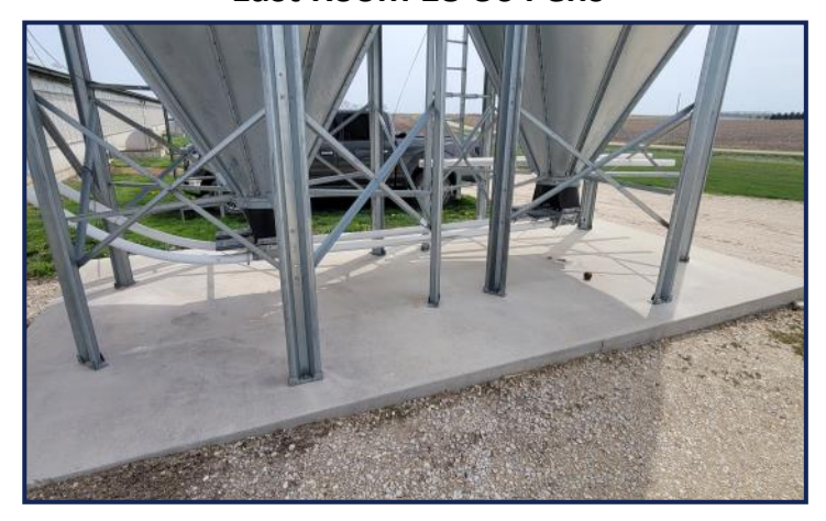
Tandem Bins 4 X 18 Ton