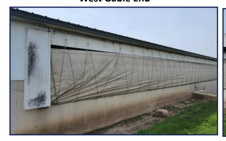
Curtains and Eves