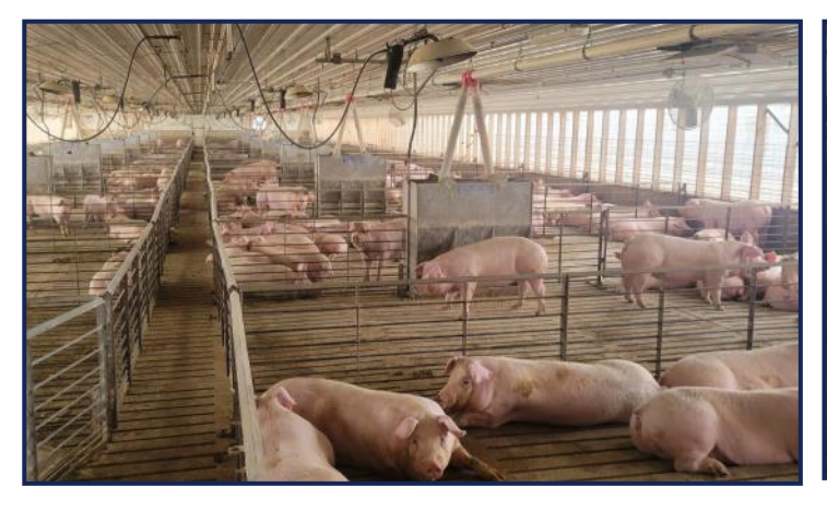
West Room Interior 17-34 pens