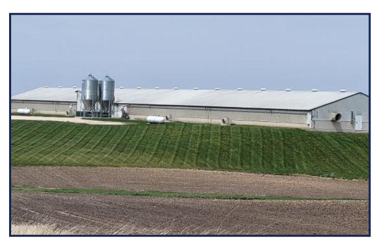
Site from Road