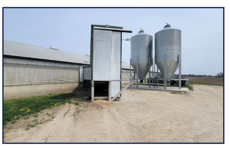
Stationary Load Out and Bins