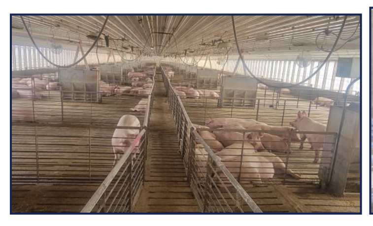
East Room 18-36 Pens