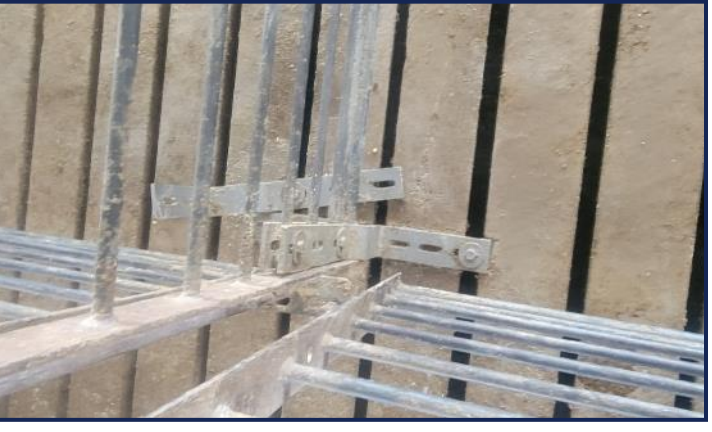
Galvanized Gating With Stainless Feet