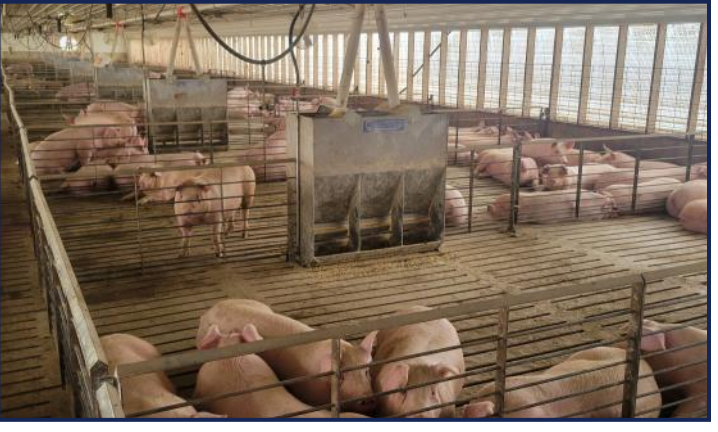
Typical Pen With Wet Dry Feeder