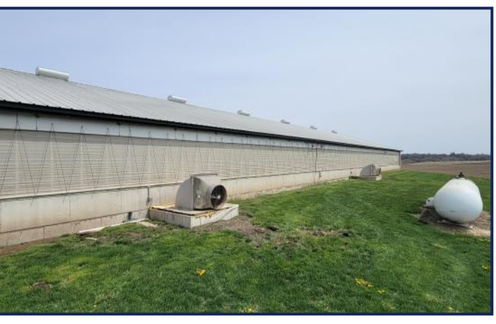
South Curtain and LP Tank (2)