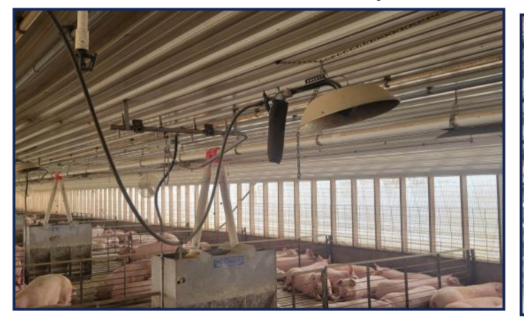
Brooders and Nipple Bars