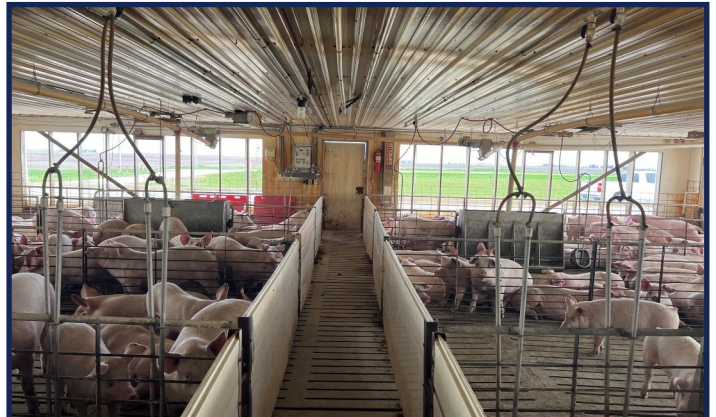
Tunnel Curtain End

The information gathered for this brochure is from sources deemed reliable, but cannot be guaranteed by Growthland or its staff. All acres are considered more or less.