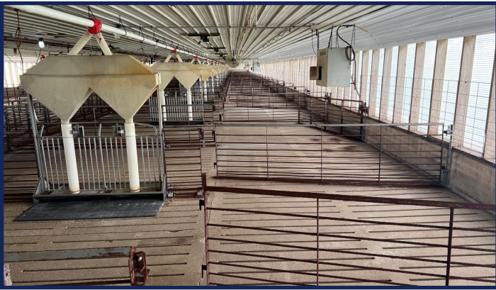
Swing Gate Design