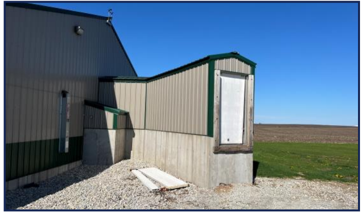
Dock Height Loadout