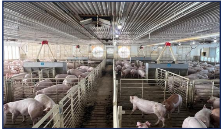
Tunnel Fan End