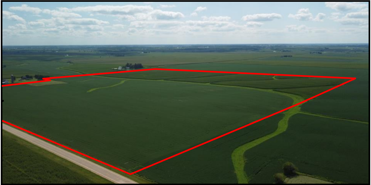
View from the northeast looking southwest