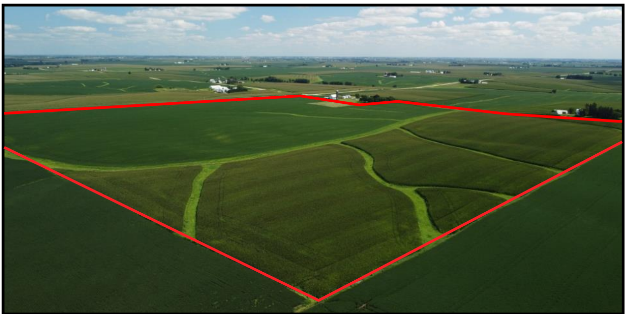
View from the northwest looking southeast

The information gathered for this brochure is from sources deemed reliable, but cannot be guaranteed by Growthland or its staff. All acres are considered more or less.