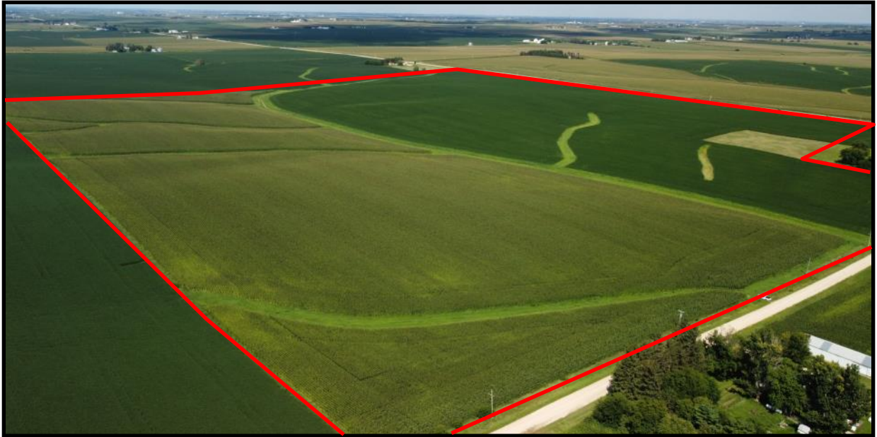
View from the southwest looking northeast