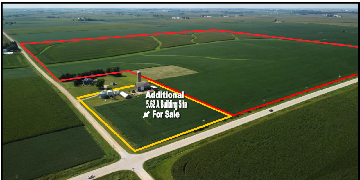
View from the southeast looking north west and additional building site also available

The information gathered for this brochure is from sources deemed reliable, but cannot be guaranteed by Growthland or its staff. All acres are considered more or less.