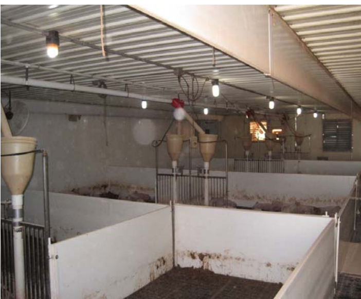
Large Pen Room View