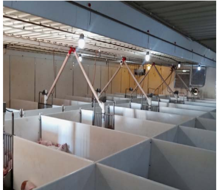
2nd Room View