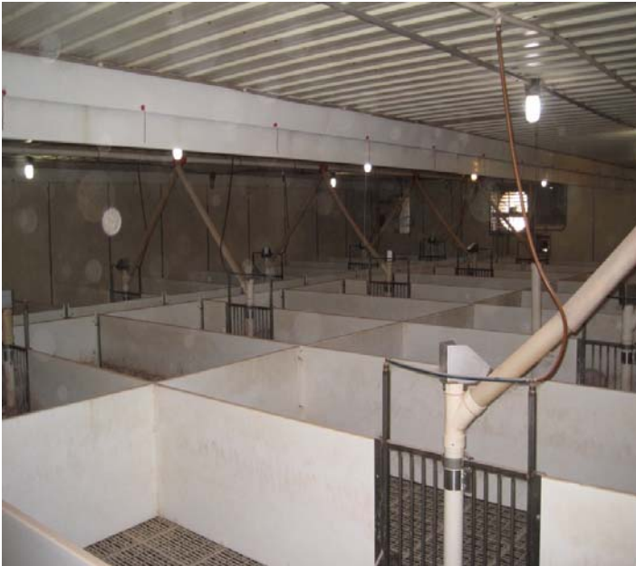
Small Pen Room View