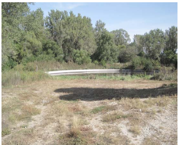
Concrete Manure Storage

The information gathered for this brochure is from sources deemed reliable, but cannot be guaranteed by Agri Management Services, Growthland Realty and Appraisal, or its staff. All acres are considered more or less.