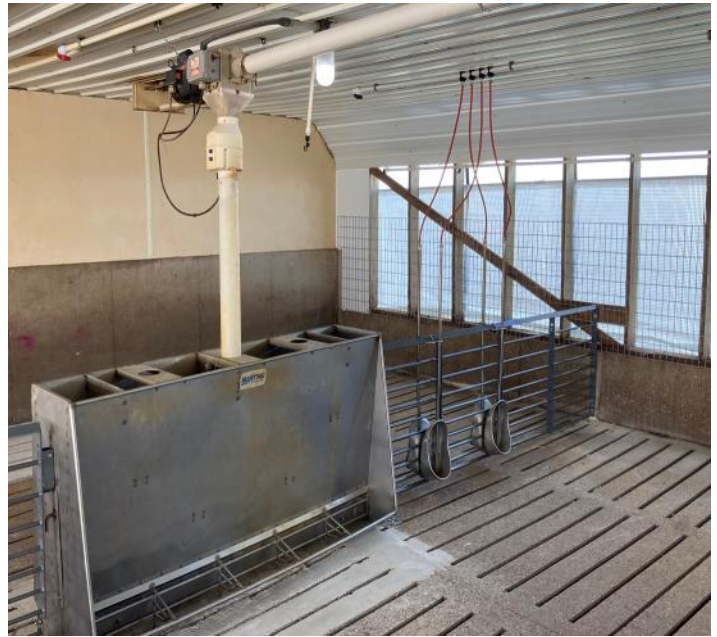
SS Feeders & Water Cups