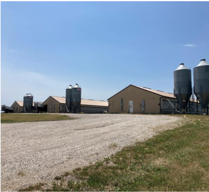
3,900 Head Finish Site