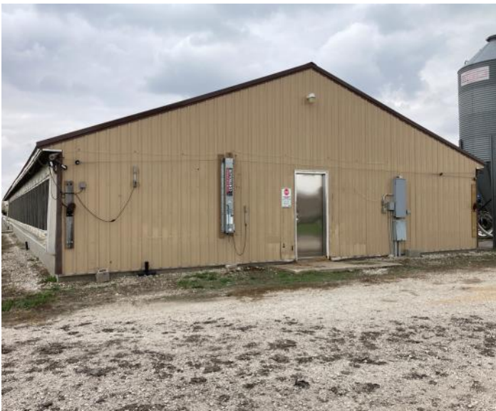
Exterior End View