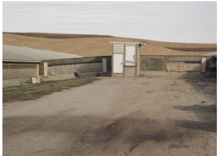
Hi Lo Load Out